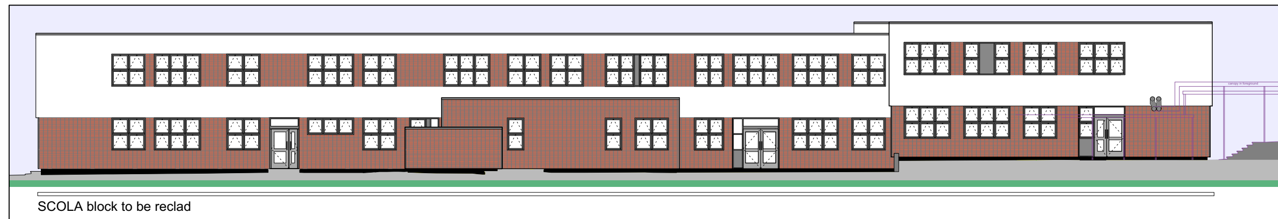
Typical Proposed Elevation

Please note: Brickwork/ render colour to be determined at a later date in conjunction with stakeholders