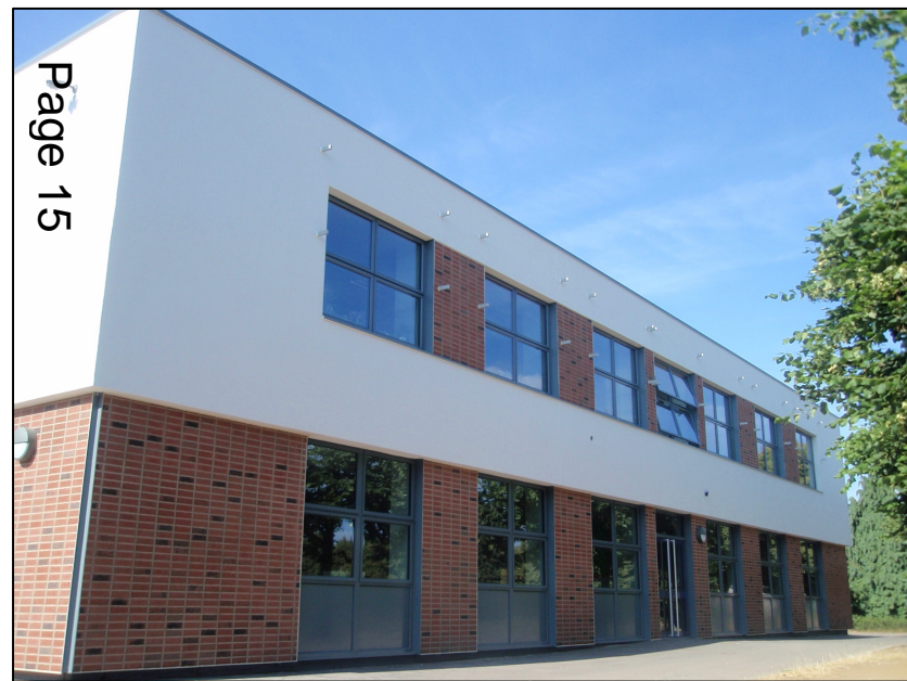
Example of a typical recladding scheme following completion